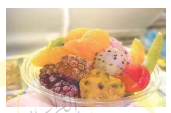
Figure 2.1 HOW TO MAKE FRUIT ICE